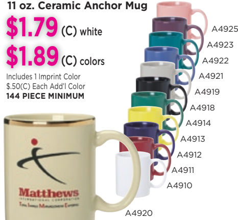
Pictured with optional 22K Gold band.

Includes 1 Imprint Color $.50(C) Each Add'l Color 144 PIECE MINIMUM