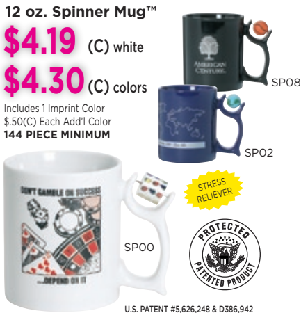
U.S. PATENT #5,626,248 & D386,942

Includes 1 Imprint Color $.50(C) Each Add'l Color 144 PIECE MINIMUM